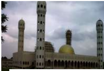
Aiwe Central Mosau

This Department of the Structural Engineering Division deals with all categories of public buildings namely, hotels, office blocks, hospitals, mosques, churches, markets, shops, restaurants, etc., and different types of development from project or concept planning, site investigations and budget estimates, through design to construction supervision.