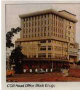
CCB Head Office Block Enugu