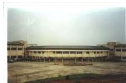
Admin Building, Faculty of Engineering, UNIUYO