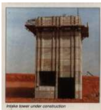
Intake tower under construction

This Department deals with special structures, such as stadia, hydraulic structures, masts, towers, silos, water towers, factories, warehouses, dams and harbor works. ENPLAN GROUP has over the years improved the use of computer aided design methods and models, in providing services to numerous complex assignments in this Department.