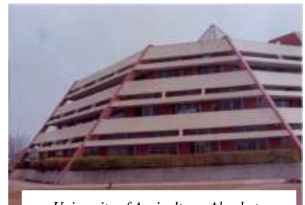
University of Agriculture, Abeokuta (UNAAB) Library