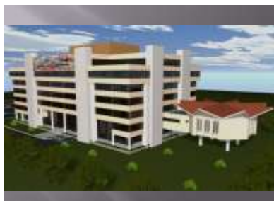
Proposed Senate Building LASU, Ojo Campus

The activities of this Department primarily involve the structural analysis and construction supervision of buildings. They are generally medium rise structures but with specialized areas requiring special treatments. ENPLAN GROUP has over the years developed expertise in this field and undertaken numerous conventional and complex assignments. :