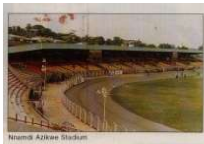
Nnamdi Azikwe Stadium