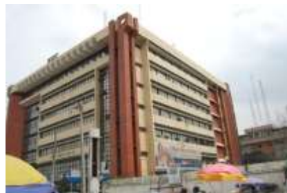
National Universities Commission (NUC) Office Building, Victoria Island, Lagos